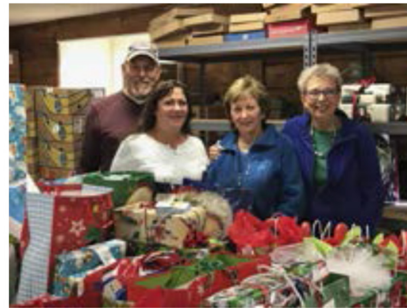
Chapel friends deliver angel tree gifts.

Thank you to all those individuals and organizations that provided financial and in-kind donations to improve the lives of those less fortunate in our community this year!