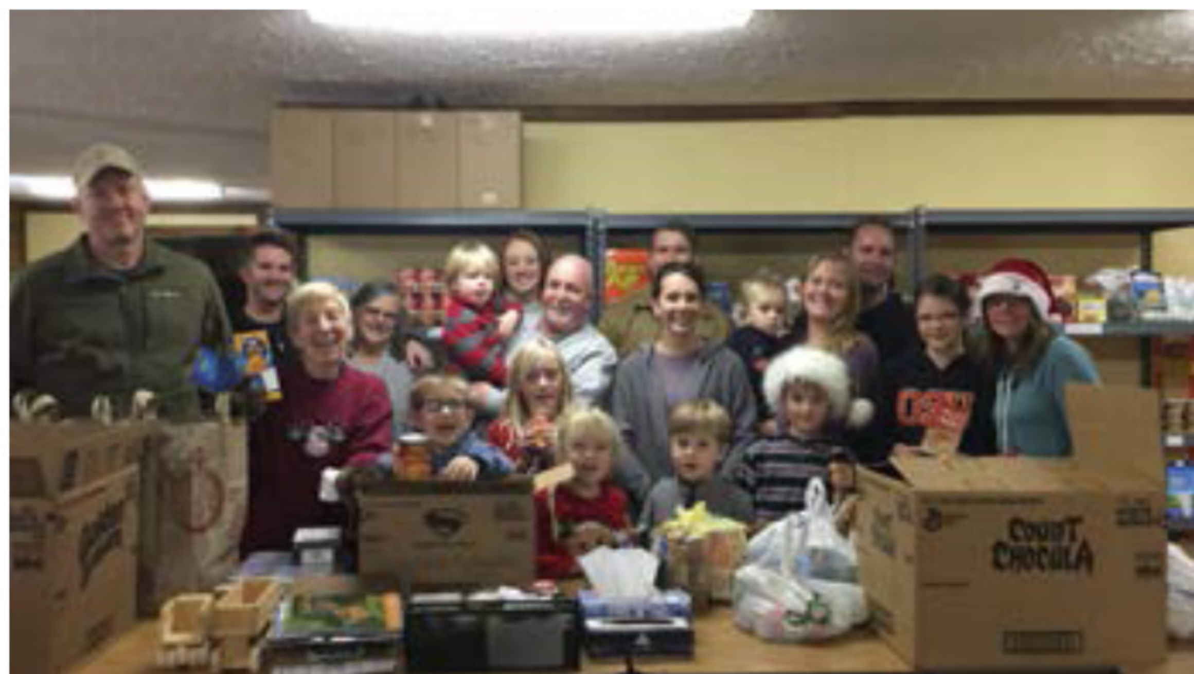
Bickel Families (Benson NC & Virginia Beach VA), Nosalek Family (Concord NC), McAteer Family (Concord NC), White

Family (Jacksonville NC) donated 276 pounds of food.