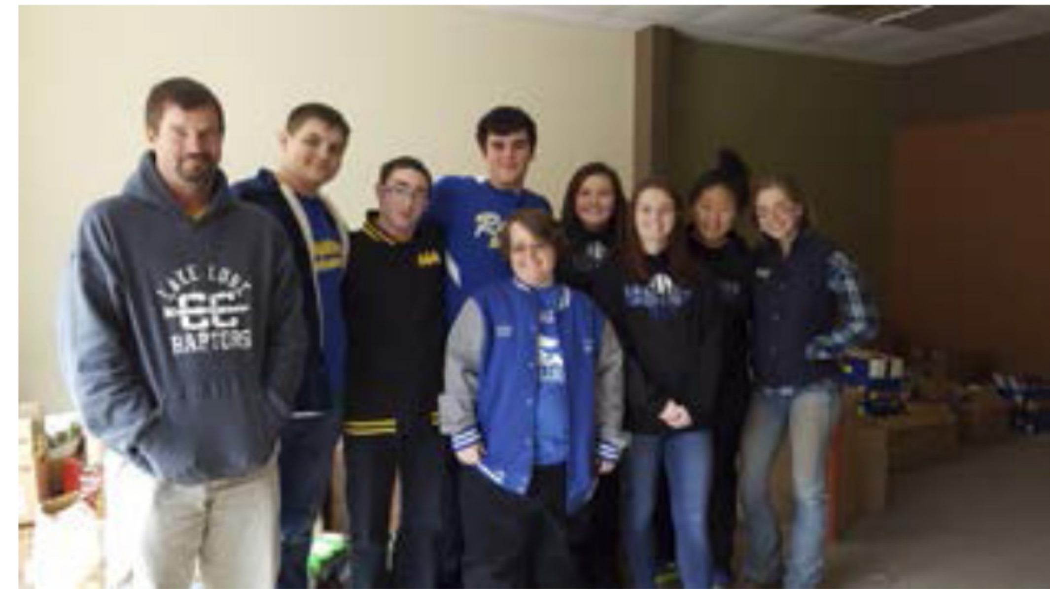
Lake Lure Classical Academy held a food drive and collected over 4200 items.

The Food Pantry provides a selection of healthy food options, toiletries and paper products. Clients shop once a month for a 3 – 5 day supply of the food items that best suits their families.