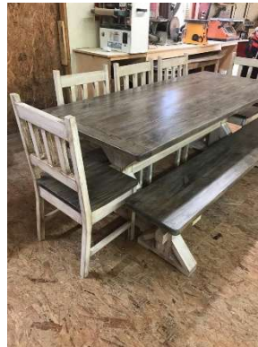
Like table to be donated